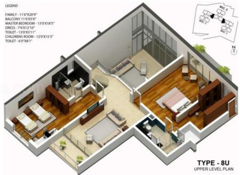
TYPE - 8U UPPER LEVEL PLAN

FAMILY - 11'0"X20'9" BALCONY 11'6"X5'0" MASTER BEDROOM - 13'0"X18'5" DRESS - 7'6"X12'10" TOILET - 13'0"X5'11" CHILDRENS ROOM - 12'0"X15'3" TOILET - 6'0"X8'11"