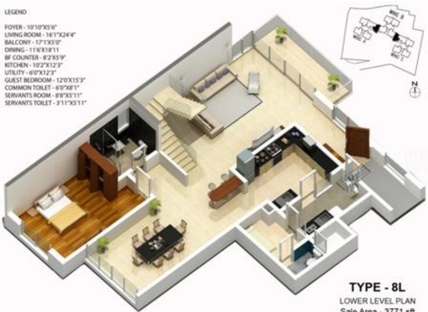
TYPE - 8L LOWER LEVEL PLAN Sale Area - 3771 sft

FOYER - 10'10"X5'6" LIVING ROOM - 16'1"X24'4" BALCONY - 17'1'X5'0" DINING - 11'6"X18'11" BF COUNTER - 8'2'X5'9" KITCHEN - 10'2'X12'3" UTILITY - 6'0"X12'3" GUEST BEDROOM - 12'0"X15'3" COMMON TOILET - 6'0"X8'11" SERVANTS ROOM - 8'8"X5'11" SERVANTS TOILET - 3'11"X5'11"