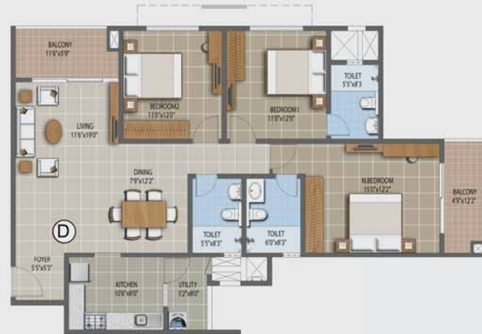
Type D - 3B + 3T (Grand)

Furniture fixtures or fittings shown in the floor plan are not standard and will not be provided in the apartment. Areas mentioned herein are approximate and shall vary based on selected apartment. Common areas/lobbies and window placement may vary based on selected floor. All plans are in accordance with the latest approved sanctioned plan and are subject to changes mandated by government authorities and /or applicable laws from time to time.