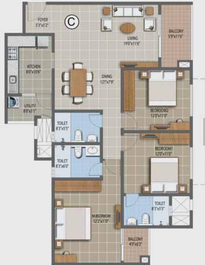
Type C - 3B + 3T (Grand)