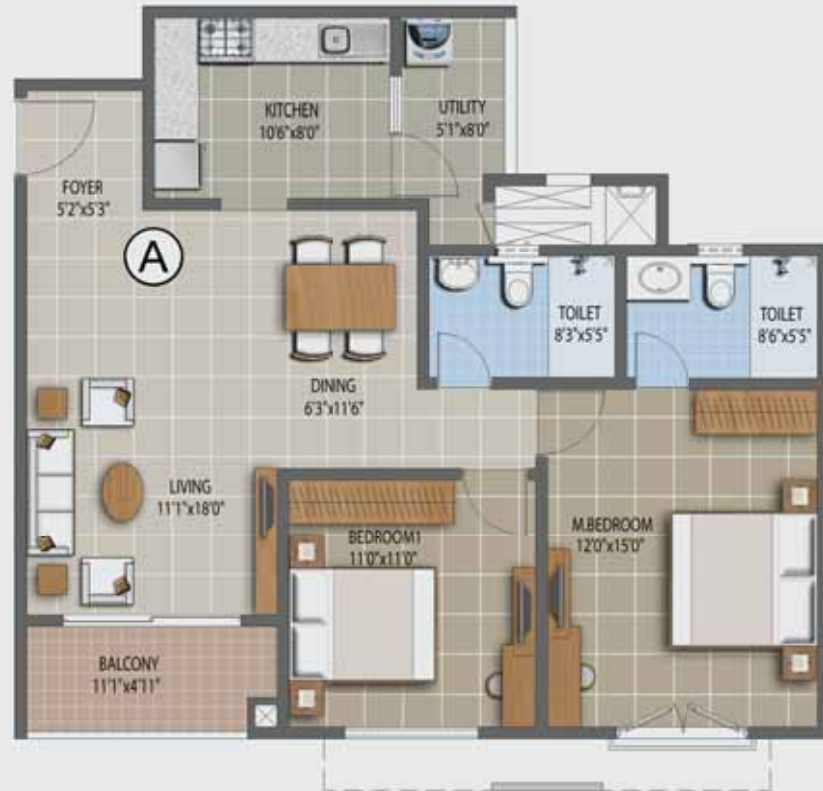
Type A - 2B + 2T