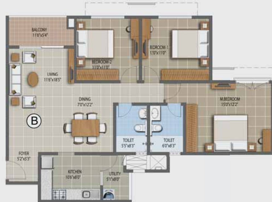
Type B - 3B + 2T (Comfort)

Furniture fixtures or fittings shown in the floor plan are not standard and will not be provided in the apartment. Areas mentioned herein are approximate and shall vary based on selected apartment. Common areas/lobbies and window placement may vary based on selected floor. All plans are in accordance with the latest approved sanctioned plan and are subject to changes mandated by government authorities and /or applicable laws from time to time.