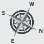
Wing - A Landscape/ City View