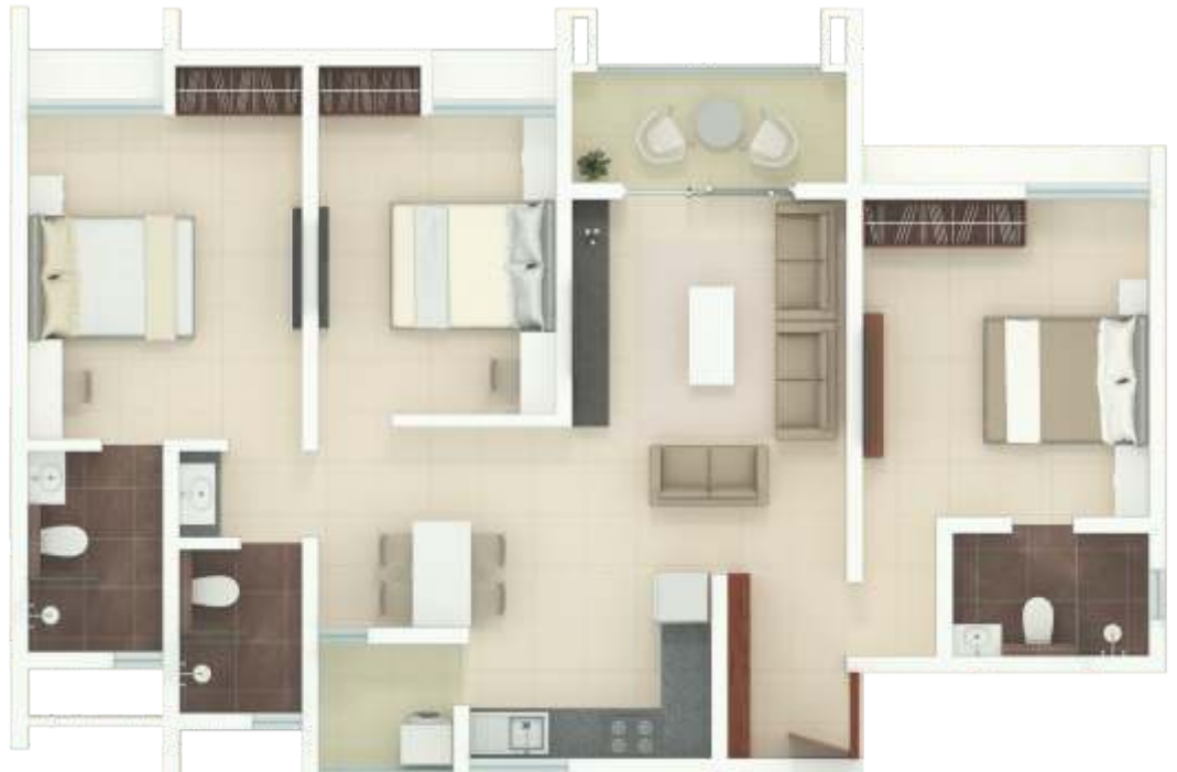
Typical 3 BHK