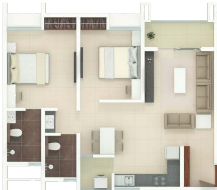
Typical 2 BHK Type - 2