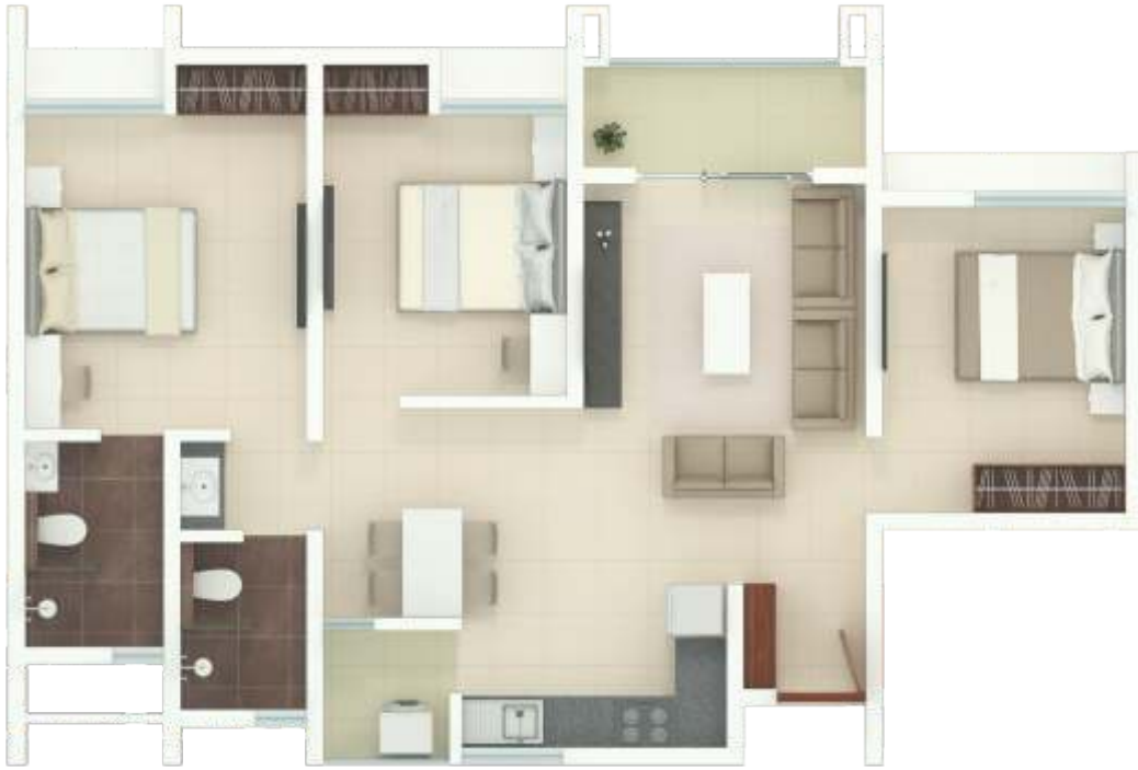
Typical 2.5 BHK