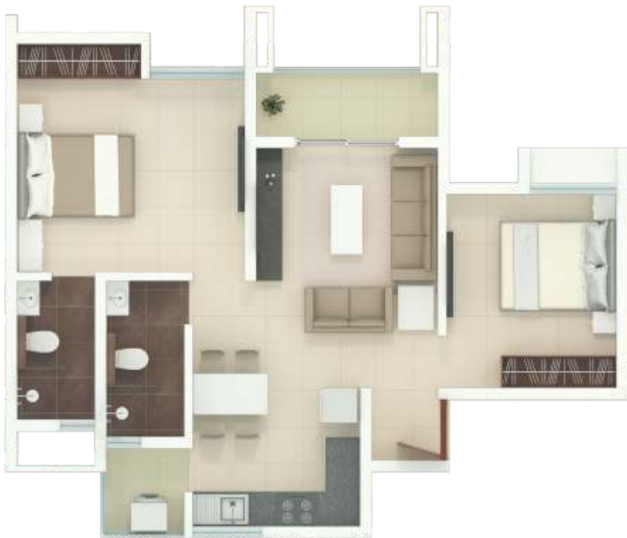
Typical 2 BHK Type -1