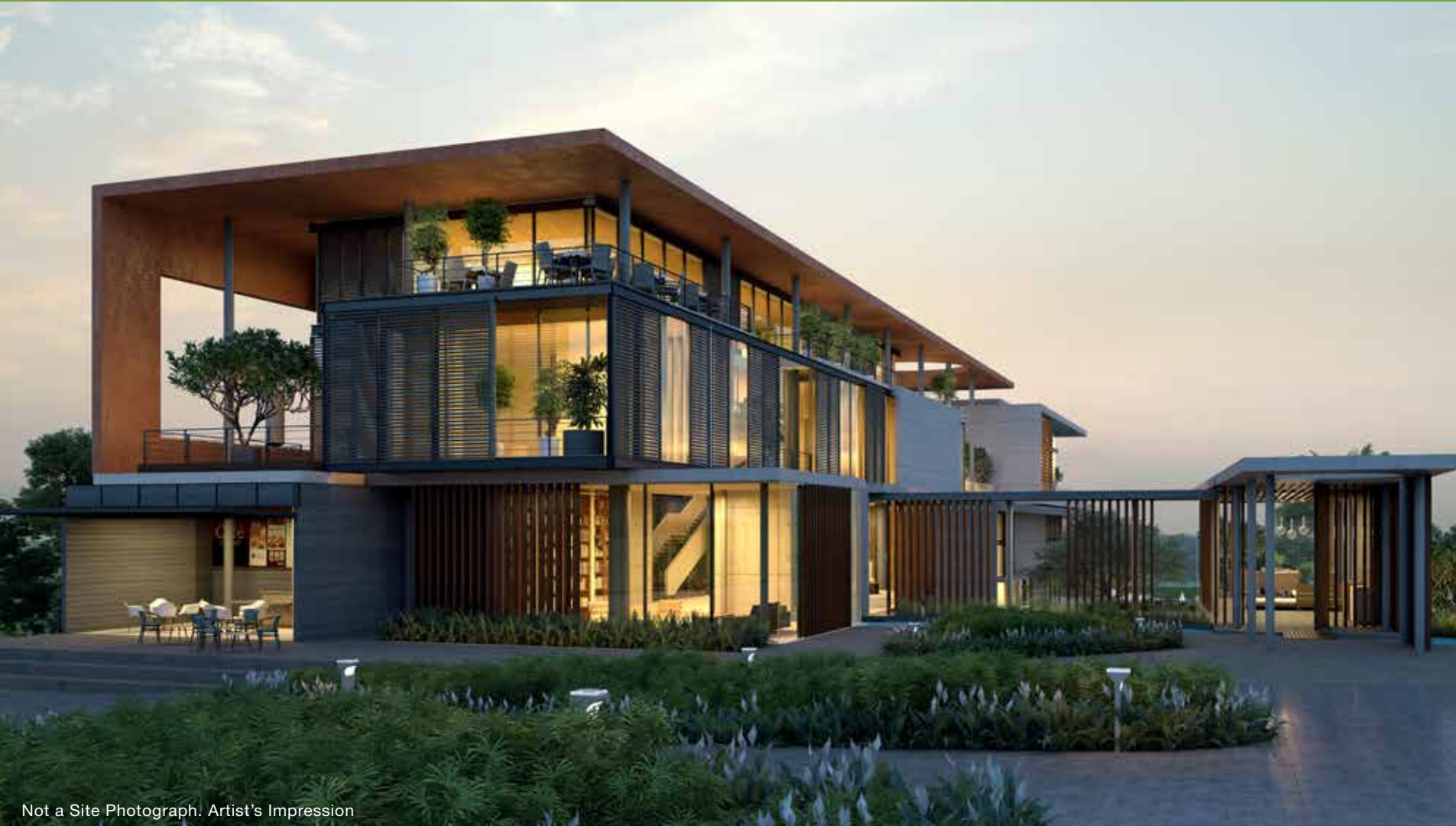
Not a Site Photograph. Artist's Impression

Godrej Properties' first plotted development, spread across a sprawling 92.7 acres .