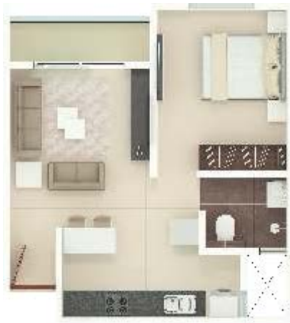
Typical 1 BHK

Our architects draw up every floor plan with you in mind. With little or no wastage of space, ours is an organic design that wraps itself around your needs, making every home a tribute to life.