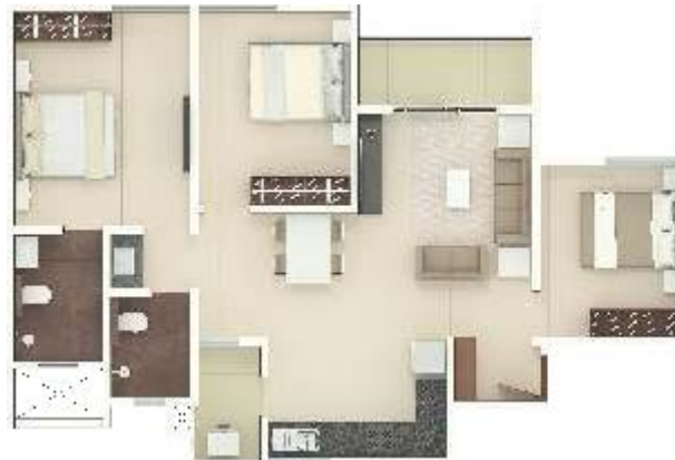
Typical 3 BHK

Carpet Area: 710 - 750 sq ft Super Builtup Area: 1050 - 1280 sq ft