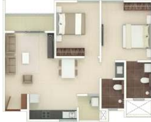
Typical 2 BHK (Type-2)

Carpet Area: 620 - 650 sq ft Super Builtup Area: 940 - 1200 sq ft