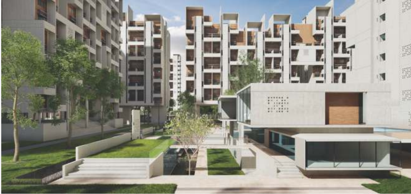
ROHAN ABHILASHA, PUNE Seamless Life in Smartly Designed Homes