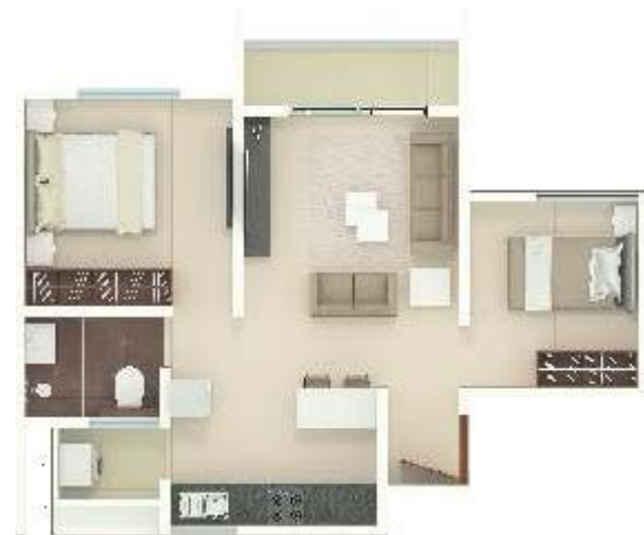
Typical 1.5 BHK

Carpet Area: 400 - 430 sq ft Super Builtup Area: 610 - 740 sq ft