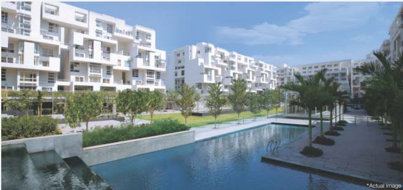
ROHAN MITHILA, PUNE Breezy, spacious homes surrounded by vast, lush-green landscape.