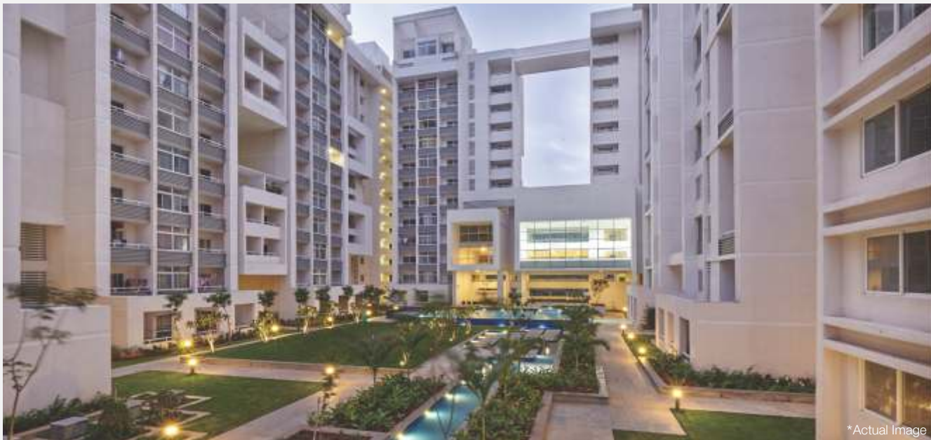
ROHAN AVRITI, BENGALURU Surprisingly private property with exclusive landscaped views, no overlooking windows and secluded home entrances.