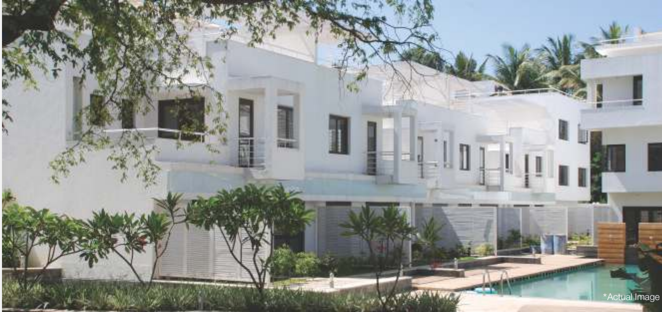
ROHAN ASHIMA, BENGALURU Split-level open homes, built with less walls and more space.