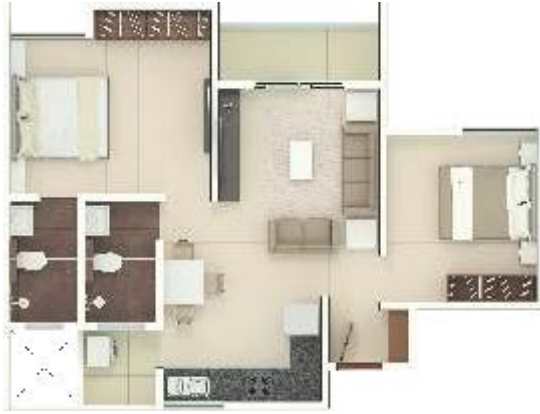
Typical 2 BHK (Type-1)

Carpet Area: 620 - 650 sq ft Super Builtup Area: 940 - 1200 sq ft