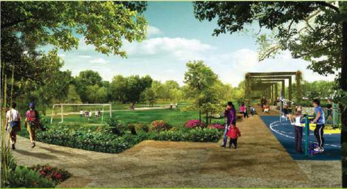
Architect's perspective of Greenbay Walking Trail & Mini Soccer Play Area

Touch of Nature makes the whole world kin.