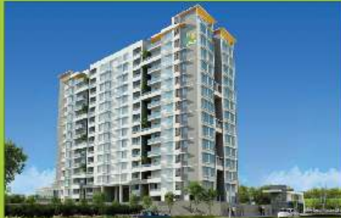
SNN Raj Neeladri - Electronic City Ph 1

30 Acres - 2500+ Units, G + 13 Floors 2 BHK 905 - 1250 Sft., 3 BHK 1150 - 1960 Sft. and 4 BHK 2180 Sft. One Lakh Sft. Clubhouse, biggest in Bangalore. 3 Sides Open Apartments, Natural and Man-made Lakes