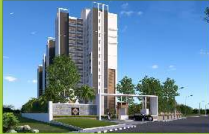
SNN Raj Grandeur - Bommanahalli, 2km. from Koramangala

4.5 Acres - 355 Units, 7 Towers, G + 14 Floors 2 BHK 1215 - 1495 Sft. and 3 BHK 1360 - 1885 Sft. SNN Signature Landscape and Fully Loaded Club House. Most of the Apartments are 4 sides open