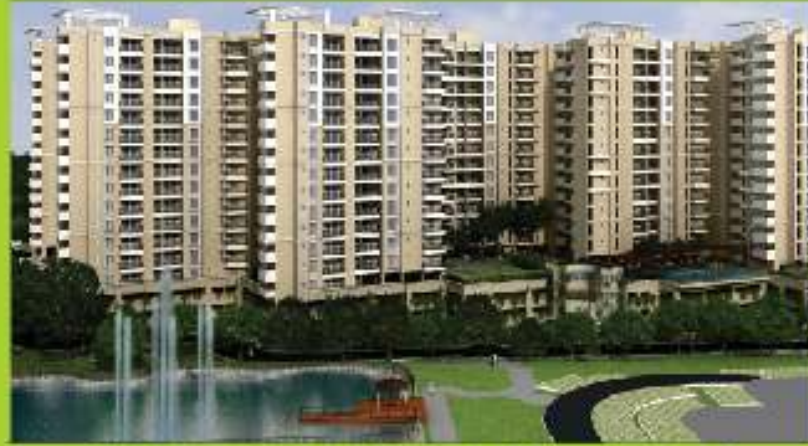
SNN Raj Serenity - Begur Main Road, off Bannerghatta road

4.5 Acres - 355 Units, 7 Towers, G + 14 Floors 2 BHK 1215 - 1495 Sft. and 3 BHK 1360 - 1885 Sft. SNN Signature Landscape and Fully Loaded Club House. Most of the Apartments are 4 sides open