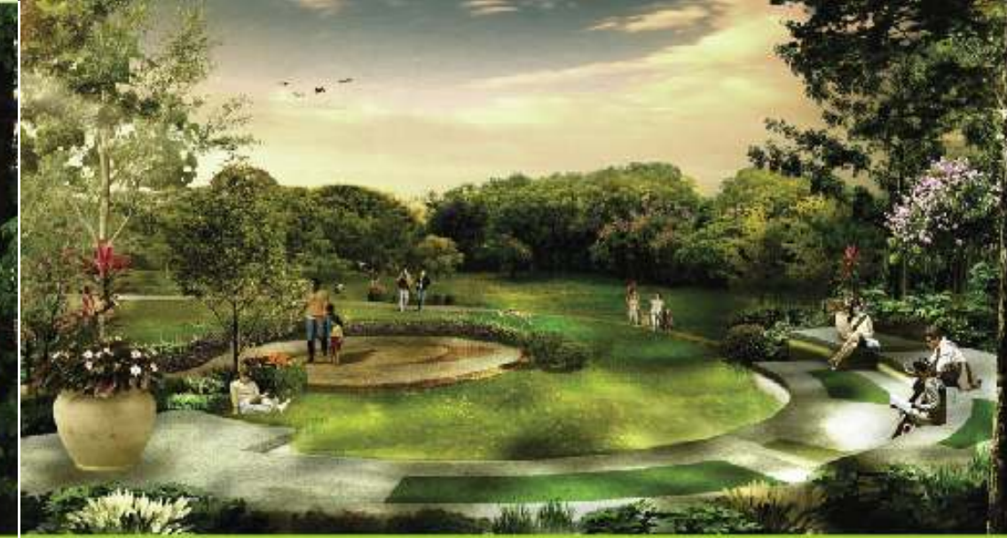
Architect's perspective of Greenbay Amphitheater with Forest backdrop

The best way to thank nature is to live with it.