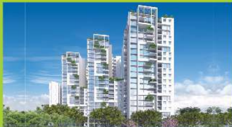
SNN Raj Eternia - Harlur Road, Sarjapur

High-end Apartments, Marble Flooring for entire Apartment Signature Clubhouse. Motion controlled lights for toilets, digital locks