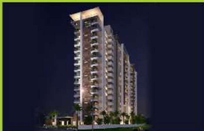
SNN Raj Spiritua - Banashankari

4.5 Acres - 181 Units, 3 Towers of G + 17 Floors 3 BHK 2250 - 2400 Sft., 4 BHK 3000 - 3300 Sft. and 5 BHK 5450 Sft. Ready to occupy, Five Star Clubhouse and Signature Landscape. 500 Mtrs. from Madiwala Lake