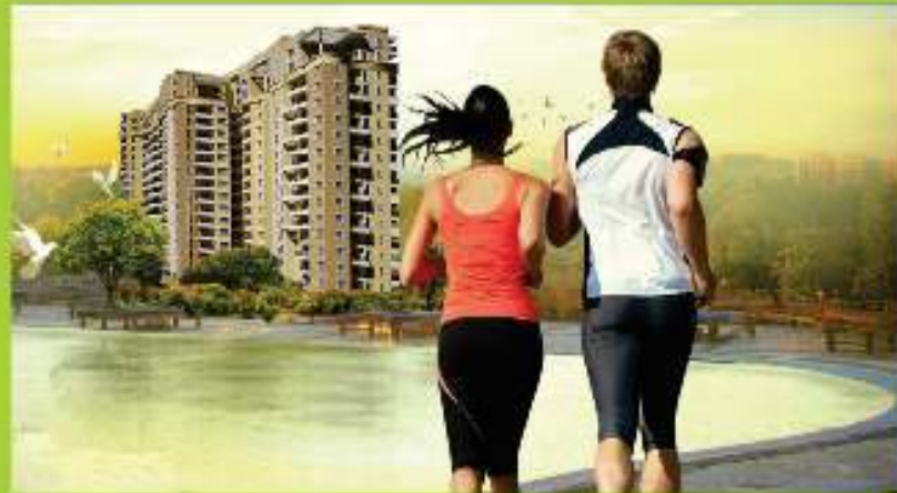
SNN Raj Lakeview - BTM 2nd Stage

Hop to Work, enjoy stress-free life. Smaller Community. Unique Amenities with a touch of Novelty like Rock Climbing Wall, Planet Cardio Gym