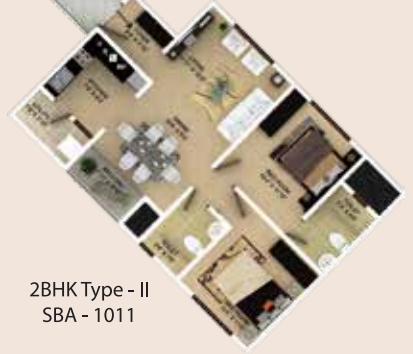
2BHK Type - II SBA - 1011