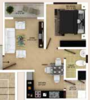
1BHK Type - II SBA - 605