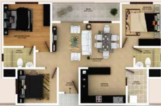
2.5BHK Type - III SBA - 1268