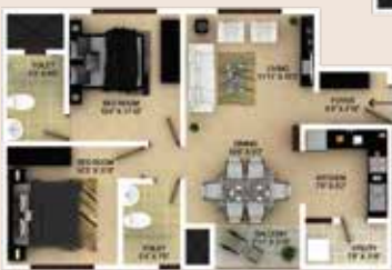
2BHK Type - II SBA - 1011