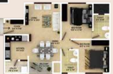
2BHK Type - II SBA - 1011