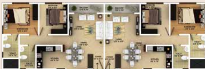
2BHK Type - I SBA - 1059