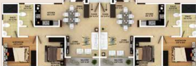
2BHK Type - I SBA - 1059