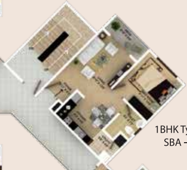
1BHK Type - 1 SBA - 624