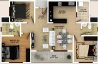
2.5BHK Type - III SBA - 1268