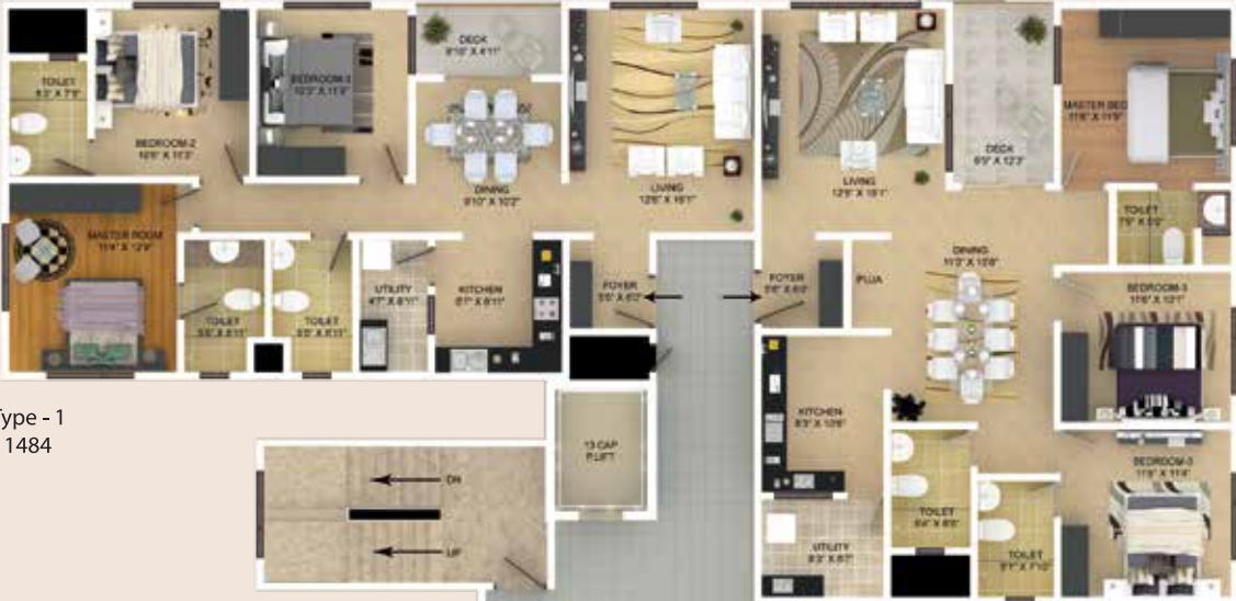
3BHK Type - I SBA - 1484