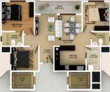
2.5BHK Type - III SBA - 1268