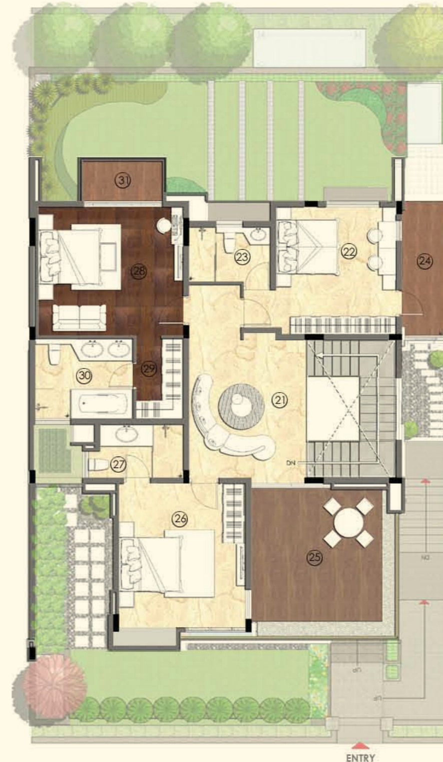
FIRST FLOOR LEVEL.