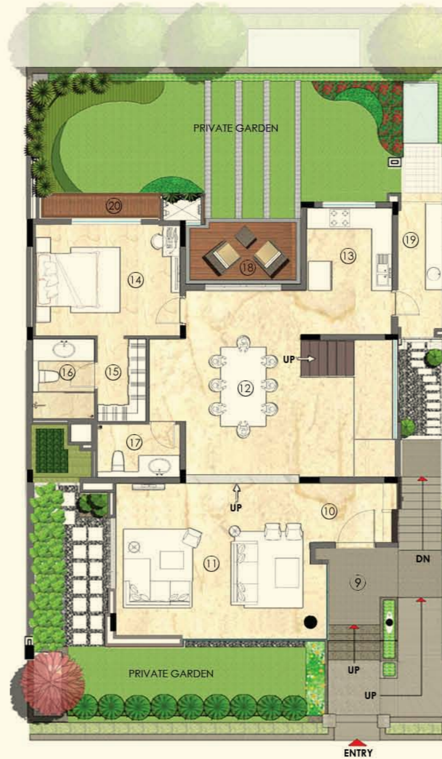
GROUND FLOOR LEVEL.

NOTE : For corner Villas private garden design varies.