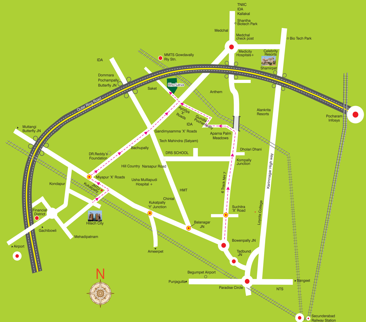
Location Map (Not to scale)