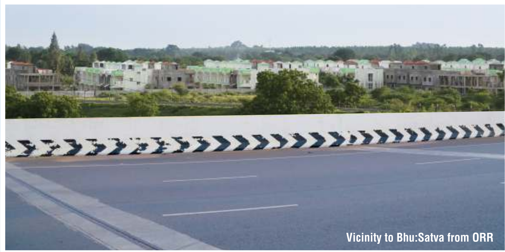
Vicinity to Bhu:Satva from ORR