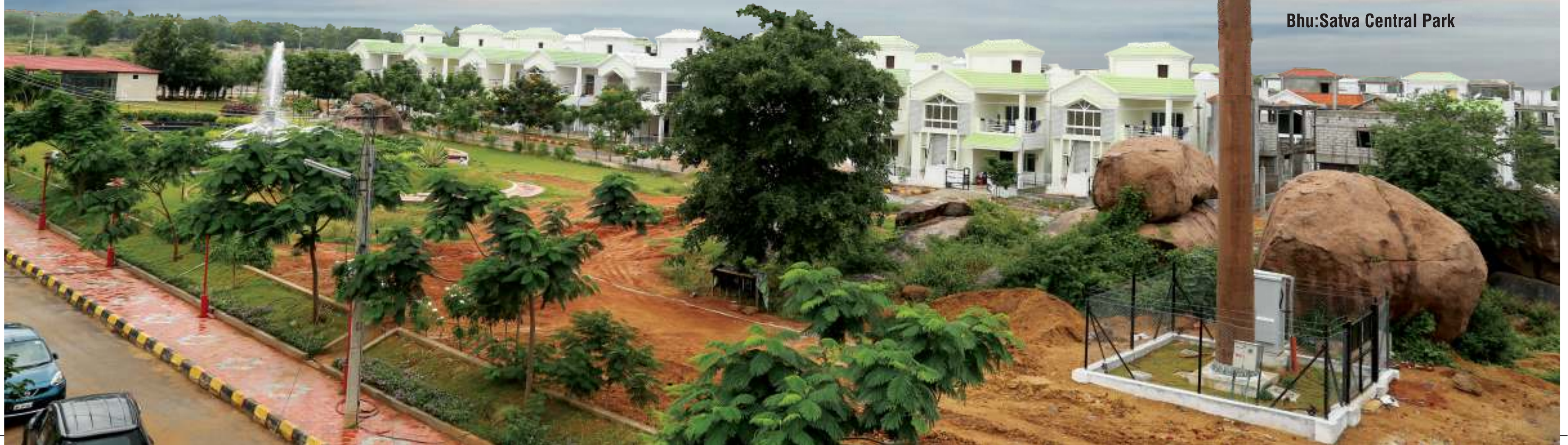
Bhu:Satva Central Park