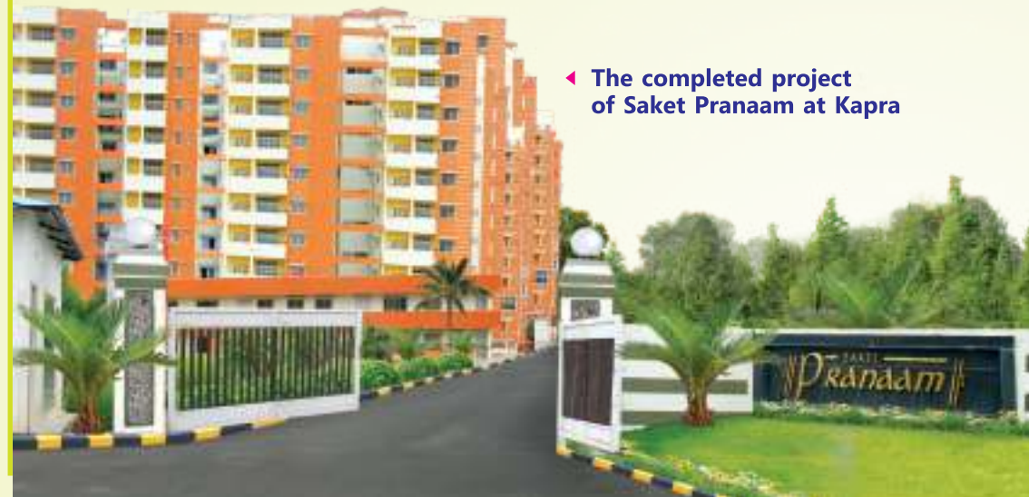
◀ The completed project of Saket Pranaam at Kapra

Give a gift of comfort to your spouse, parents or to yourself. Celebrate retired life with new friends & soulmates in the comfort & care of Saket Pranaam @ Saket Bhu:Satva.