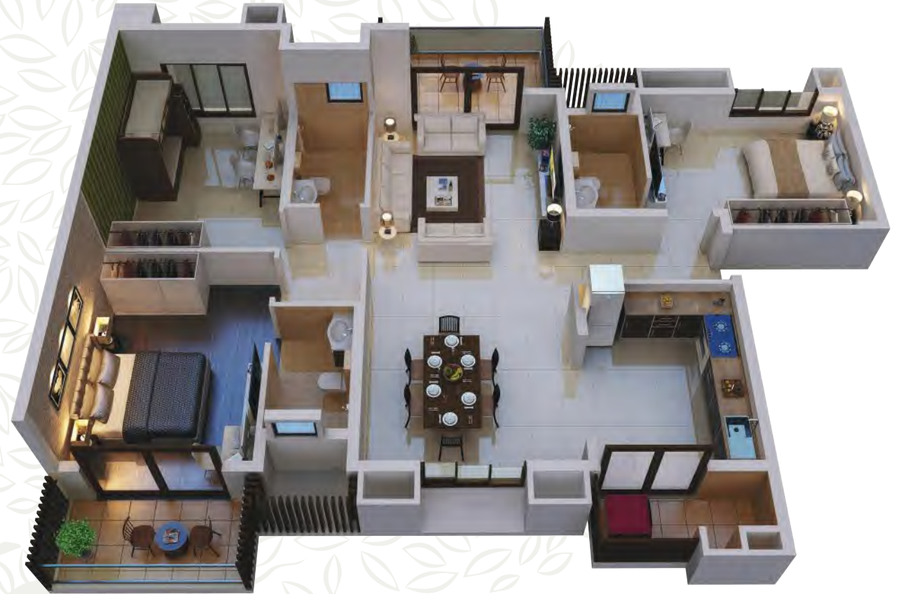
3 BHK LARGE