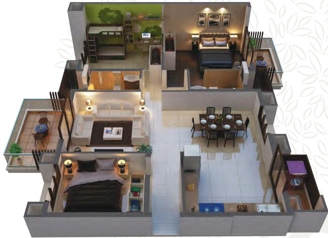
3 BHK REGULAR