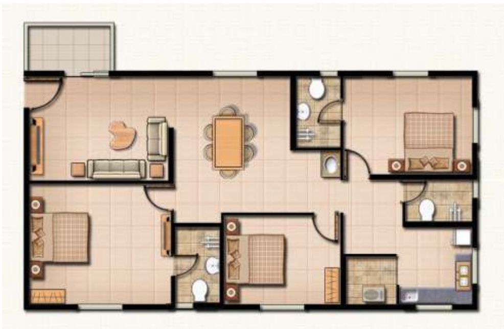
Flat-1 1801 Sq.ft. West Facing