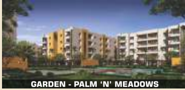
GARDEN - PALM 'N' MEADOWS