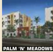
PALM 'N' MEADOWS