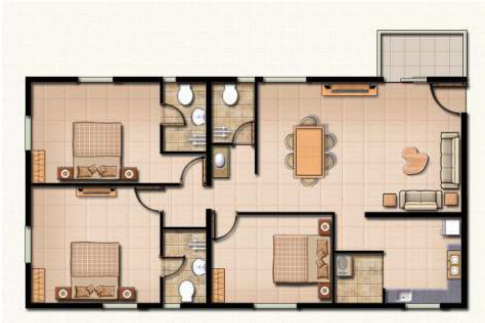
Flat-10 1801 Sq.ft. East Facing

KHAJAGUDA - M (A Joint Venture w (Beside Delhi