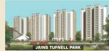
JAINS TUFNELL PARK