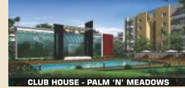
CLUB HOUSE - PALM 'N' MEADOWS