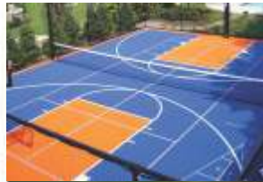
Volley Ball Court