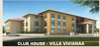
CLUB HOUSE - VILLA VIVIANAA