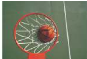
Basket Ball Post