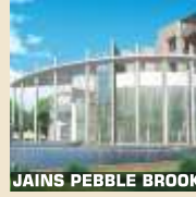
JAINS PEBBLE BROOK