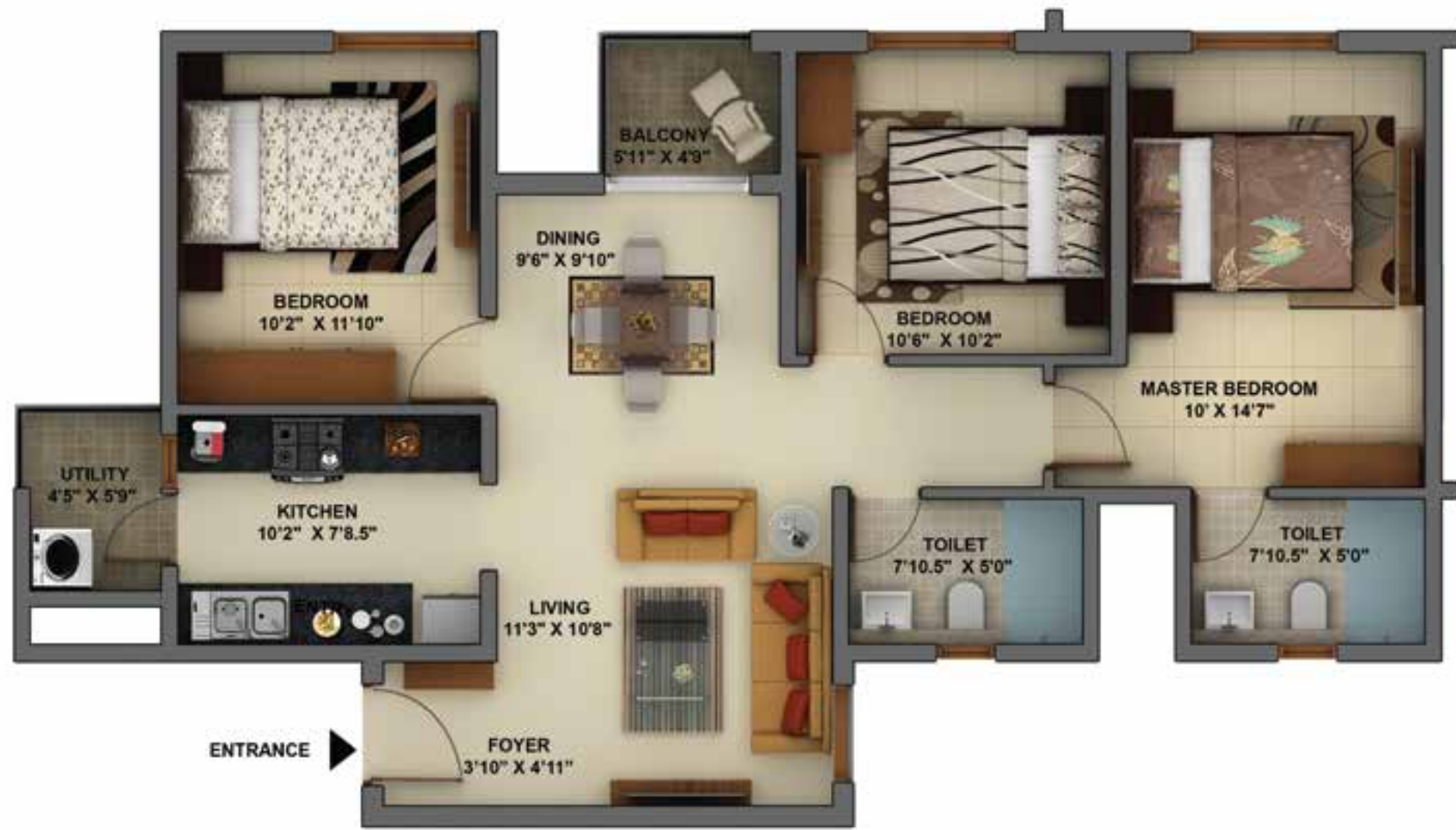
INDIVIDUAL FLOOR PLAN 1255 sqft (116.59 sqmts)