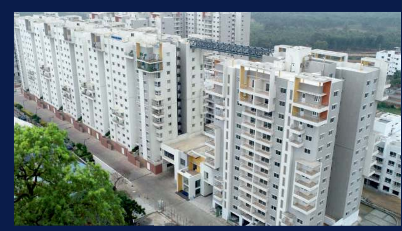
Ramky One North, Bengaluru